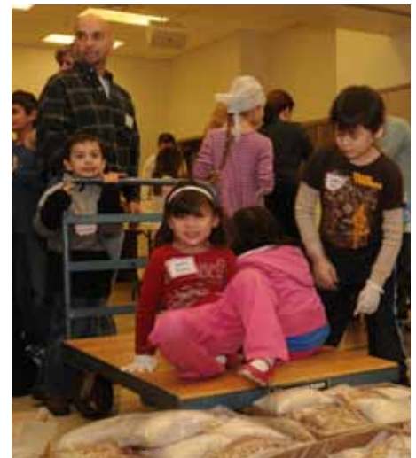
Packing rice and beans is a popular project on Family Day of Service.

Chapelwood is taking a team to Lineville, Alabama, March 11- 15, to work with our partner SIFAT (Servants in Faith and Technology). For more information about this organization, go to sifat.org . This first-ever Chapelwood family mission experience is created for families with children as young as three years of age.