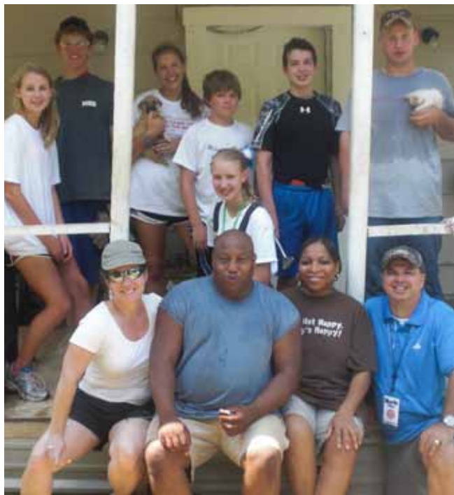
Two hardworking teams combined their efforts for a large project at SUMMIT last year.